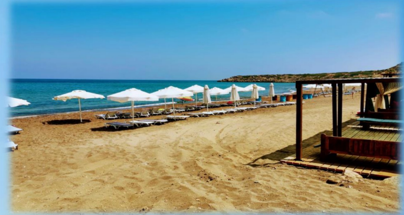
Esentepe Beach 150 mt. Walking distance from IDYLL HOMES project