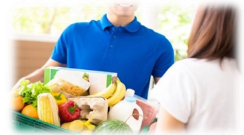
Personal Shopping Service