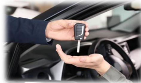
Car Rental Service