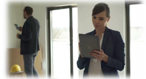
Checking the Apartment