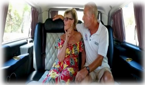
Free Shuttle Service