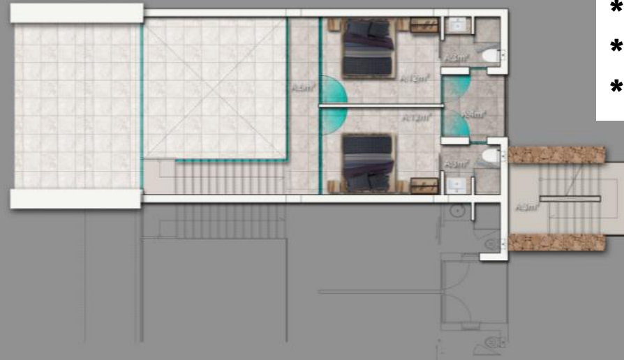
MEZZANINE FLOOR PLAN