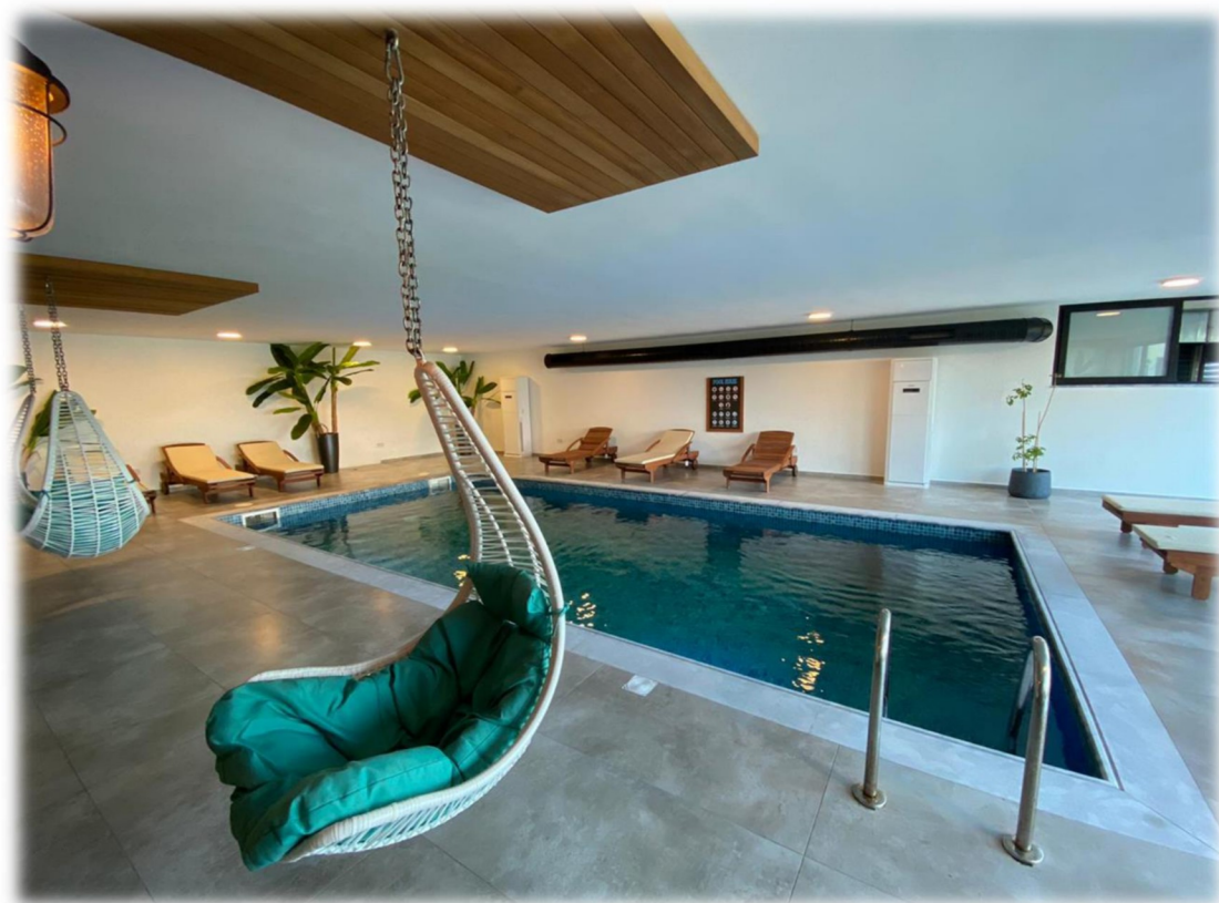
INDOOR HEATED SWIMMING POOL