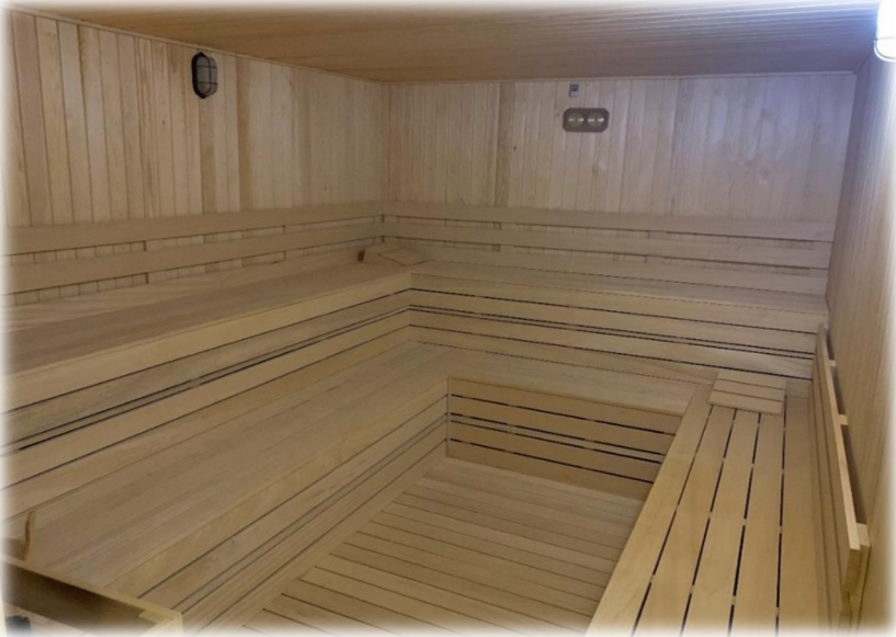
TURKISH HAMAM, SHOCK SHOWER & SAUNA