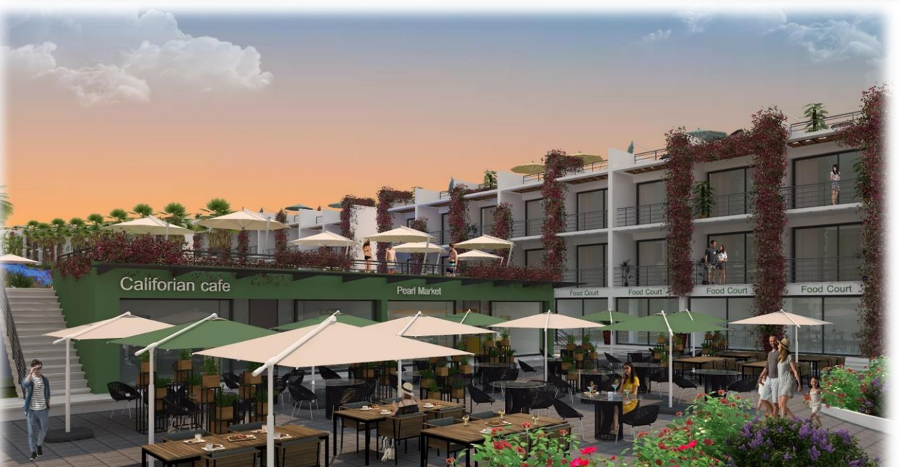
Food Court (Restaurants, Cafe & Mini Market)