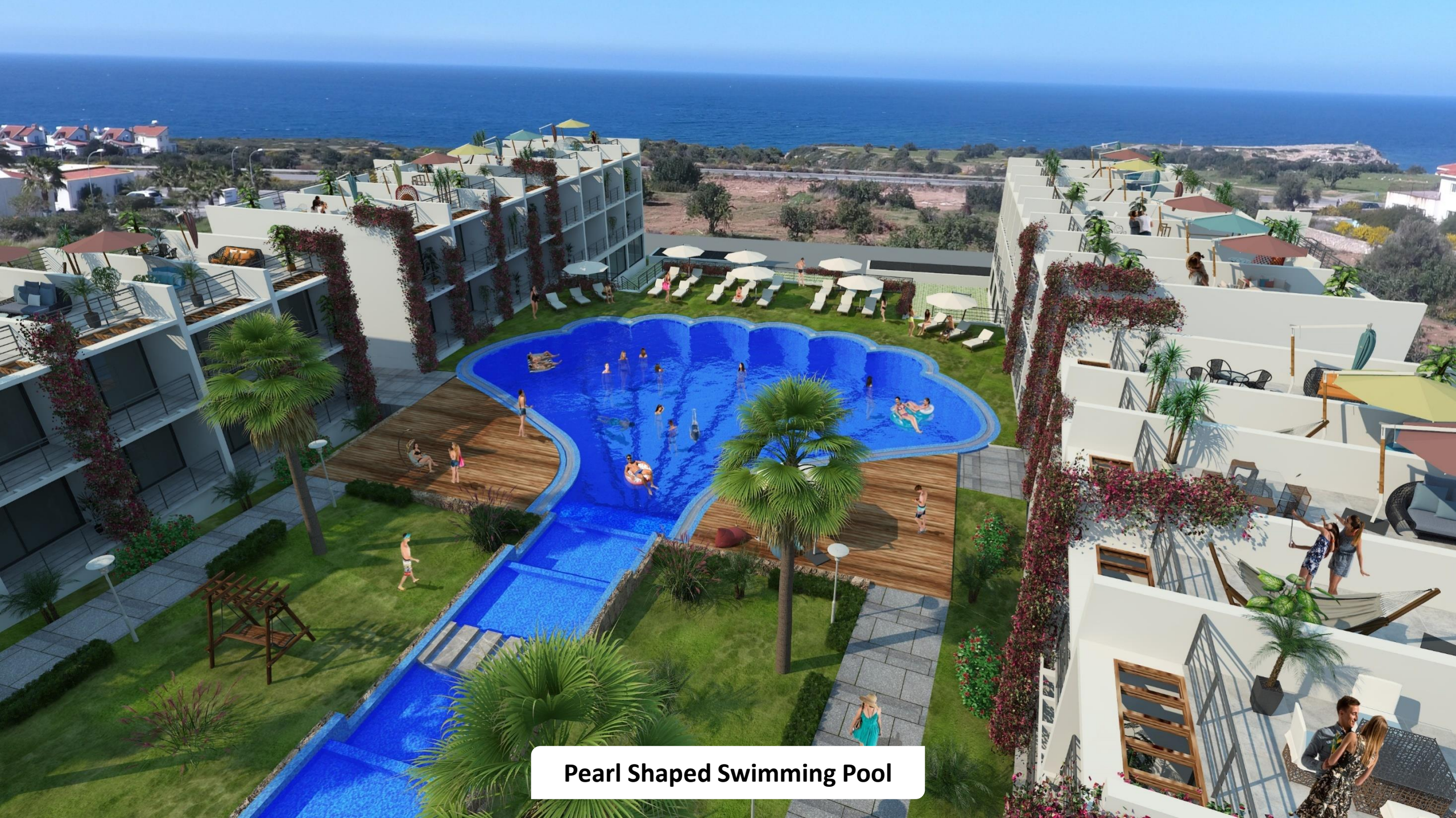
Pearl Shaped Swimming Pool