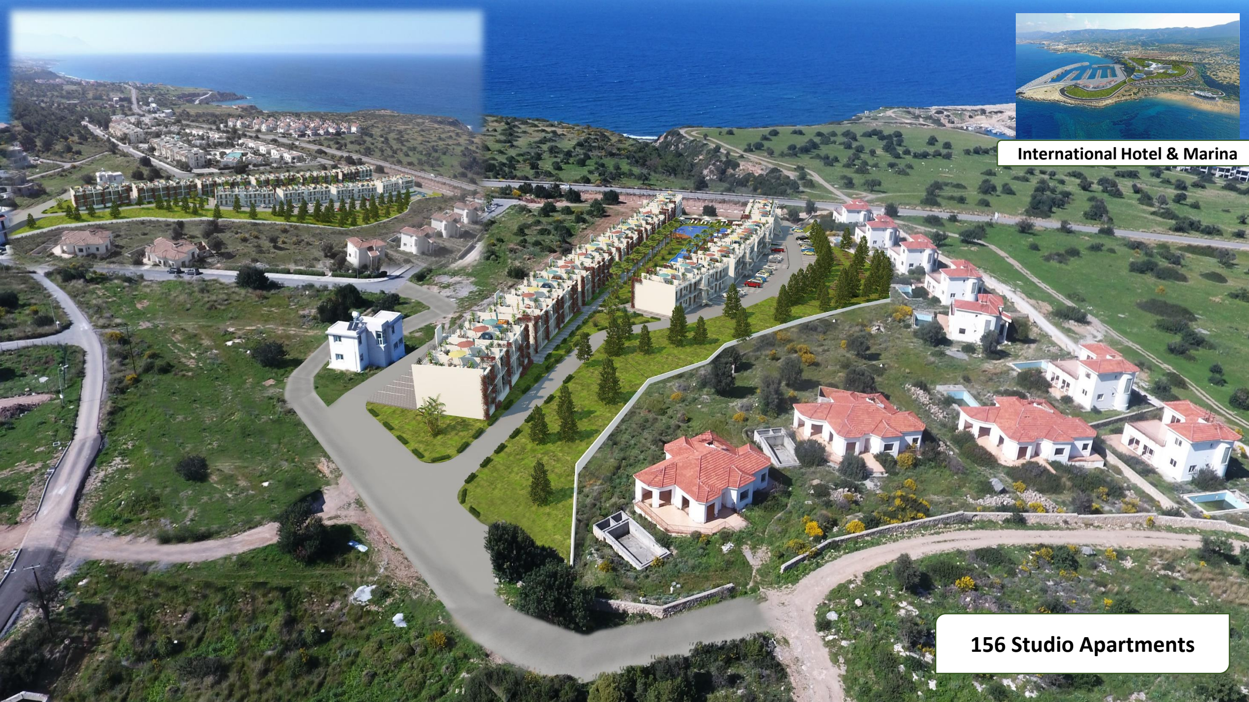
International Hotel & Marina