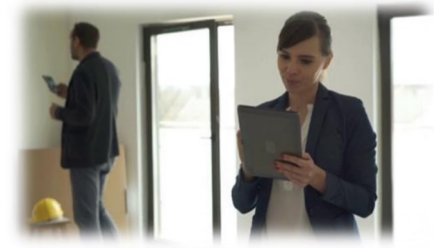
Checking the Apartment