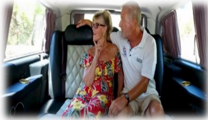
Free Shuttle Service