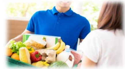
Personal Shopping Service